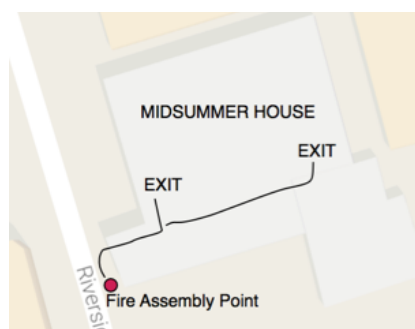
Figure 1. Car park meeting point

No visitor should re-enter the building unless advised to do so by a member of the Emergency Services .