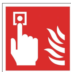
Figure 2. Fire alarm call point